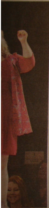
lek have outfits