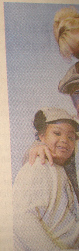
Actress Virginia work's "Fairly L Sah'ni Sanford